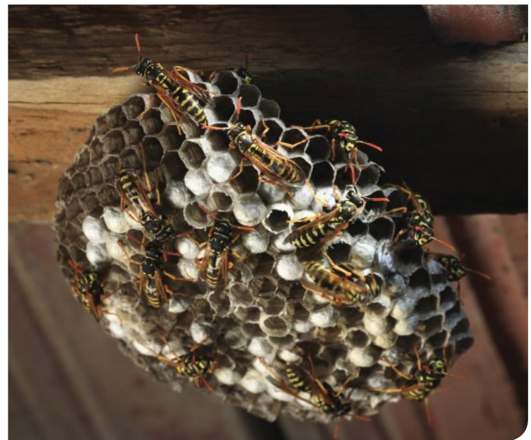
European paper wasp nest in roof space.

Contact MPI's free 24-hour pest and disease hotline 0800 80 99 66